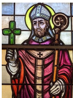
St Patrick's Day Wednesday

Stations of the Cross this Friday 5:30pm, with special prayer in this Year of St. Joseph at 5:50pm