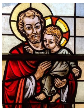
St Joseph's Day Friday