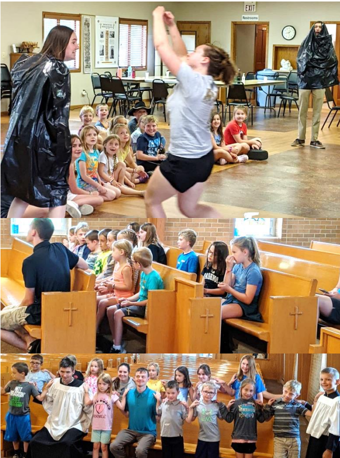
Middle and high schoolers meet for continuing Bible study Wed 7 July, 7pm in church basement

Thank you to those who prepared for and served our young people at Duc In Altum summer school this past week