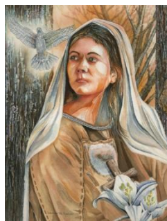
St Kateri Memorial Fri 14 July