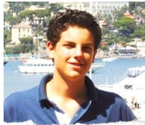
To always be close to Jesus, that is my life plan. CARLO ACUTIS

Exposition of Blessed Sacrament follows, until 8:30pm Benediction. Display boards about Eucharistic miracles & veneration of relics in Padre Hall.