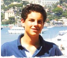
To always be close to Jesus, that is my life plan.